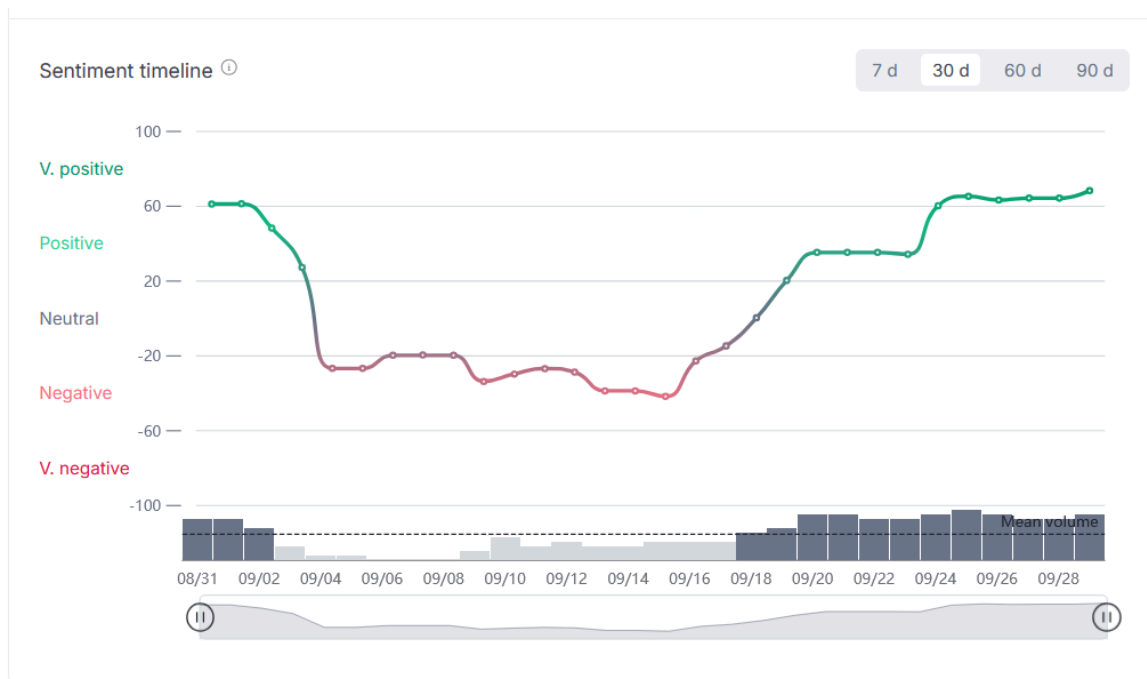
News Sentiment timeline chart